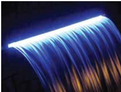
Approximate Projection of Sheet of Water per 300mm of Waterfa II Length